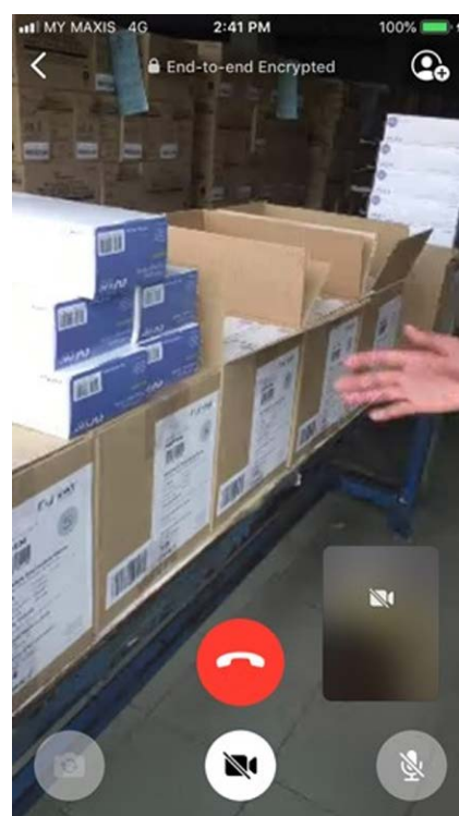
Video audit at glove factory

In addition to managing the supplier assurance process, the Assurance team also provides packaging efficiency assurance for all new products which come on-board. The aim of this activity is to ensure that all secondary and tertiary packaging is designed right first time. This ensures that any shipments from Asia are as efficient as possible, reducing cost, greenhouse gas emissions and resource utilisation.