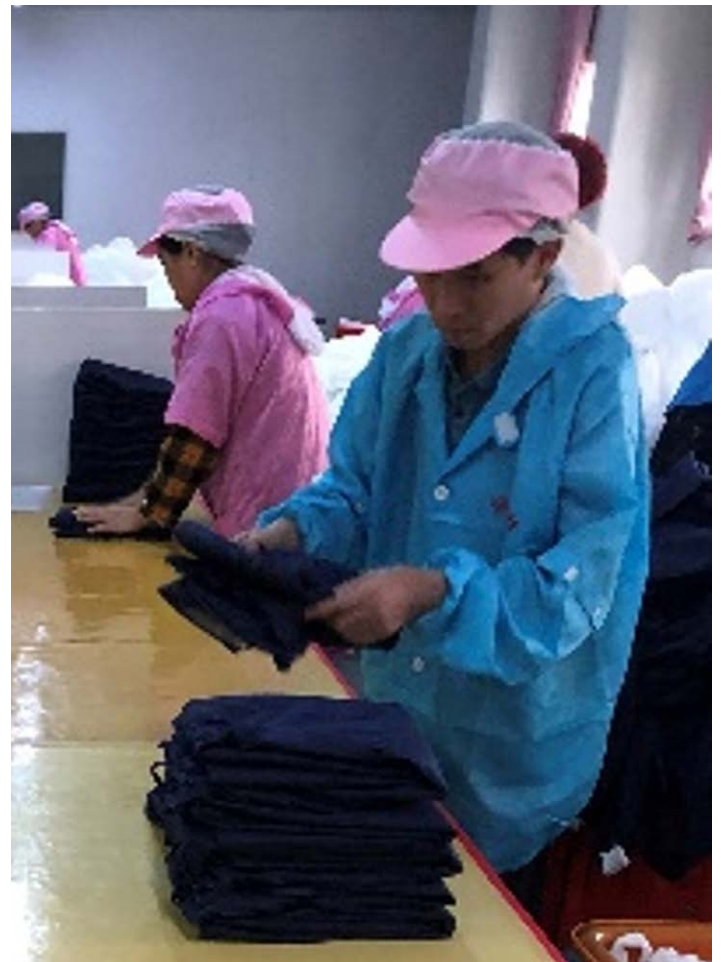
On-site audit at apparel factory

Level 2 suppliers have a minimum of three random process audits.