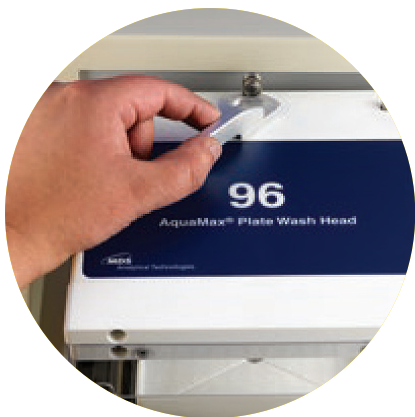
Figure 1. User-interchangeable heads. The user-interchangeable 96 and 384 wash heads can be exchanged and re-attached very quickly to the washer manifold using a simple lever mechanism.