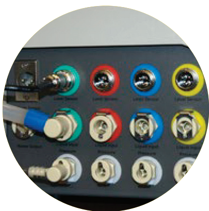
Figure 2. Color-coded inlet connectors. Color-coded inlets with quick connects decrease assembly time and allow the use of multiple buffers and solutions without bottle switching. The level sensors, when connected to the reservoir bottle sensors, detect if bottles are empty or full.