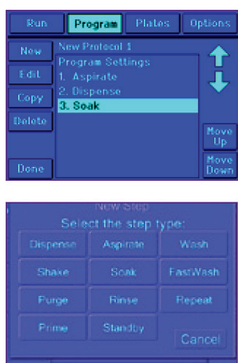
Figure 3. Touchscreen system control. Using the front panel LCD, program control features can be easily selected to set up, edit, delete, copy, and rename wash protocols, create new microplates in the microplate library, or perform washer maintenance.